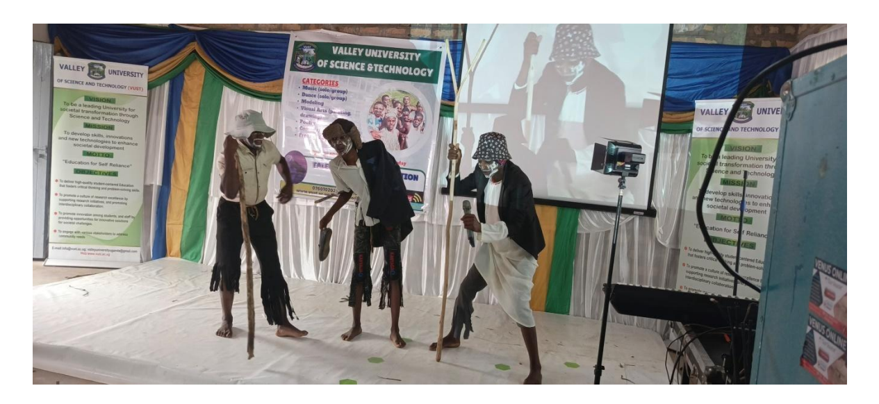
VUST Oldies Dancers

Though they did not win, the VUST Oldies Dancers left a lasting impression. Their high-energy performance had the entire audience on their feet, proving to be one of the night's most memorable moments.